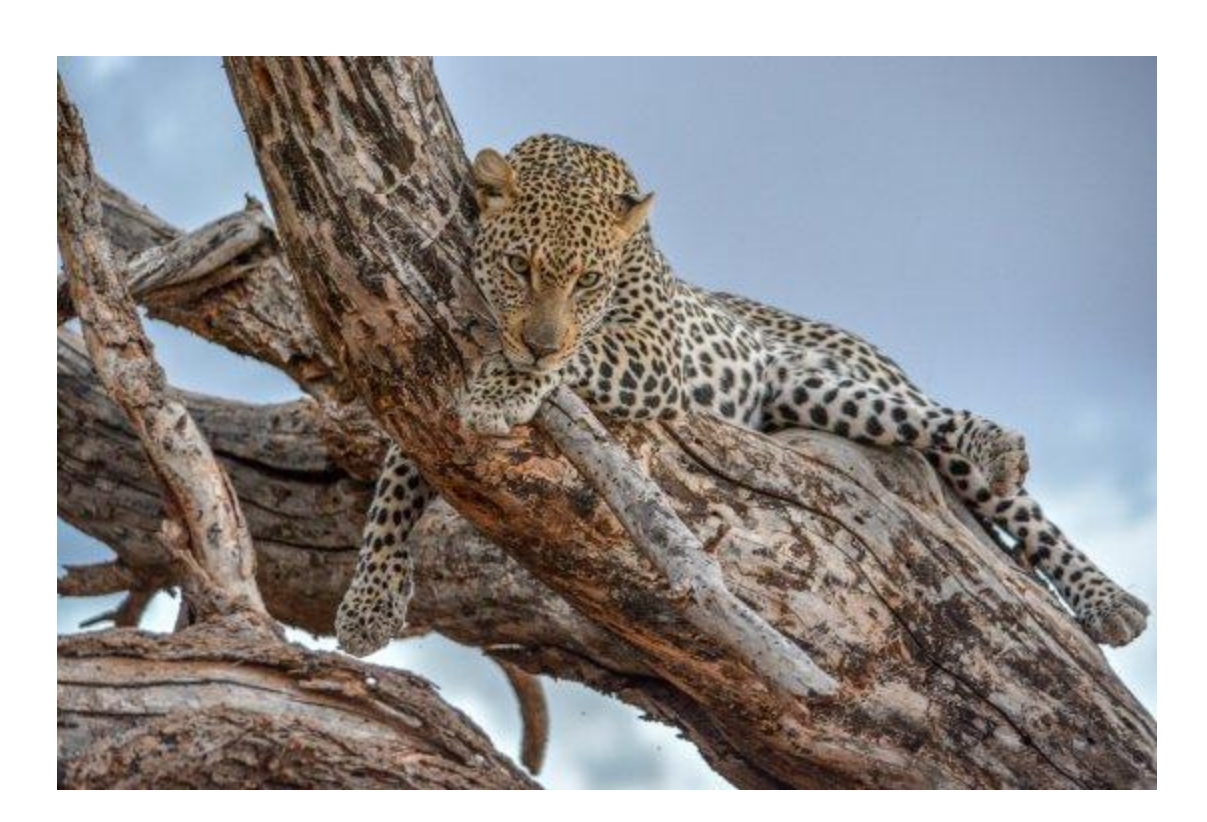
Day 2: Samburu

We will spend the whole day in the Game Reserve to include an early morning and late afternoon game drive, the best times to view the animals in their natural habitat. All meals will be served at the camp or at the Samburu lodge.