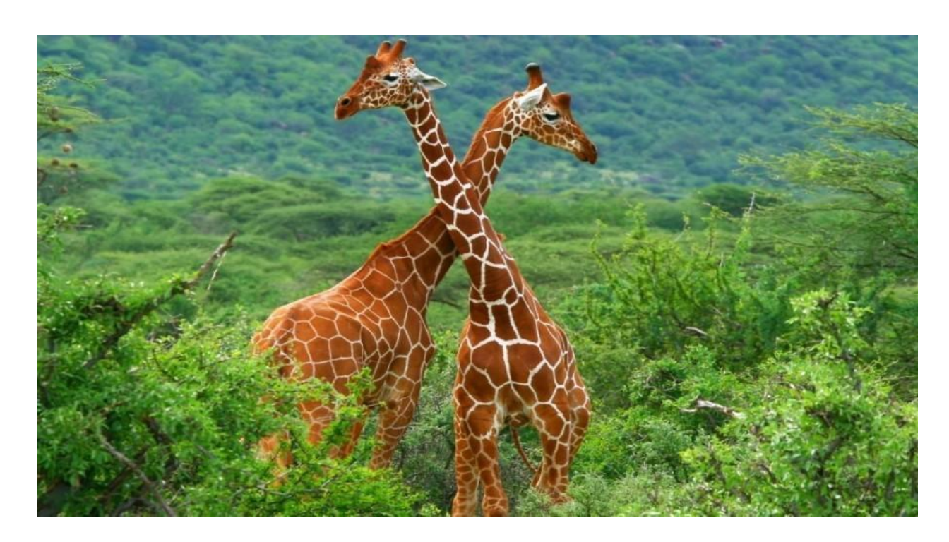
Day 2 Samburu - Lake Nakuru

After breakfast, leave Samburu with game drive en route. Drive past the northern tip of the Aberdares Mountains to descend into the Great Rift Valley where Nakuru is located, Lunch at Sarova Lion Hill Safari lodge. Game drive along the lake shore to see the abundant birdlife that Lake Nakuru is famous for. Among other animals to be seen on this day of your safari include black and white rhinos, Buffalo, leopards, waterbucks etc. Dinner and overnight in lake Nakuru lodge/camp