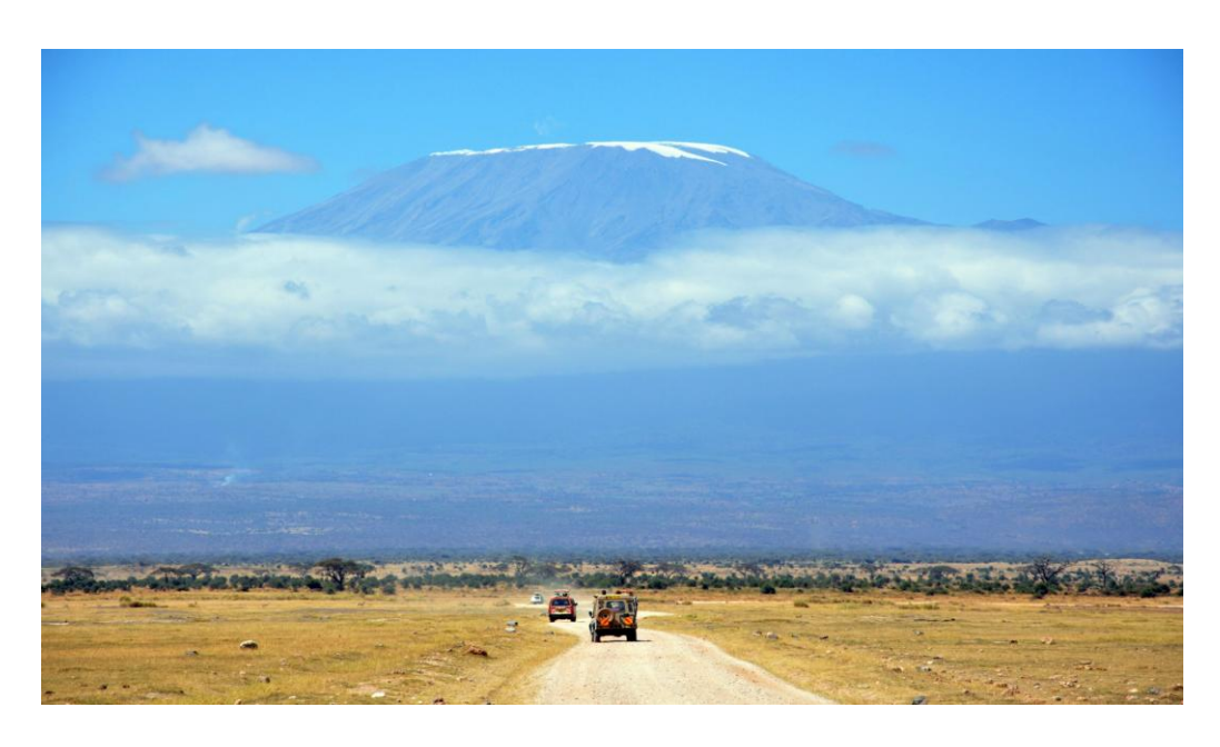
Day 3: Amboseli - Tsavo West

Wake call early morning. A brief game drive up to 0800hrs. Return for full breakfast. After breakfast check out and depart for Tsavo West national park. - View the "Shetani" lava flow, game again en-route to Mzima springs and then proceed for lunch at either <u>Kilaguni Serena Safari Lodge</u>. After lunch relax until 1600hrs time to visit the rhino sanctuary. After gaming return to the lodge for dinner and overnight.