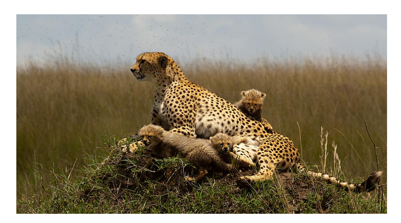
Day 2: Tsavo East - Amboseli

Early morning game drive till 0800hrs. Check out and proceed to Amboseli national park. In the Amboseli national park you view the breathtaking mount Kilimanjaro which stand at 19,340 ft. The mountain forms an awesome backdrop for your photos. Have a game drive until lunch hour then proceed to Amboseli Serena Safari Lodge for lunch. After lunch relax until 1600hrs time for the afternoon game drive. In Amboseli park you will have a chance of seeing the big five and birdlife. Dinner and overnight at he Amboseli lodge.