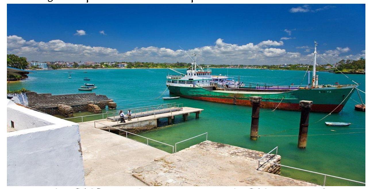
entering the Old Port and continuing towards Old spice Market. As the tour continues you will be walking through old colonial houses and

There you can learn everything there is to be learnt about Mombasa and how it evolved. After that, a guide will continue to give you a guided tour passing through the Mombasa Club, Africa Hotel, Mandhry Mosque, Government Square,