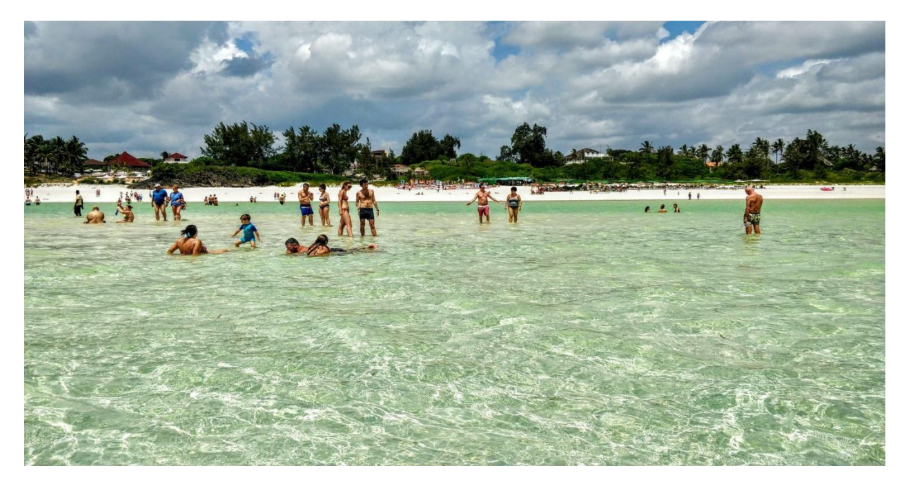
before returning to the boat and sail off to sudi island while enjoying the lush green mangroves along the creek side.