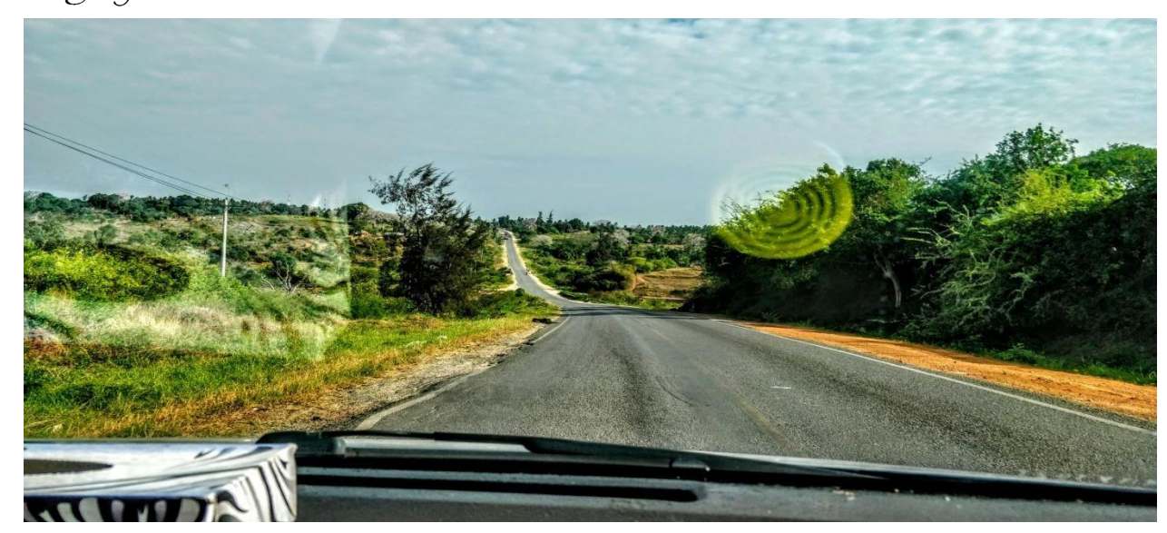
On your way you will be able to see different land scapes and plantations along the road.

Mombasa Malindi rd. Its 100kilometers from Mombasa and it will take roughly one and a half hours to reach watamu.