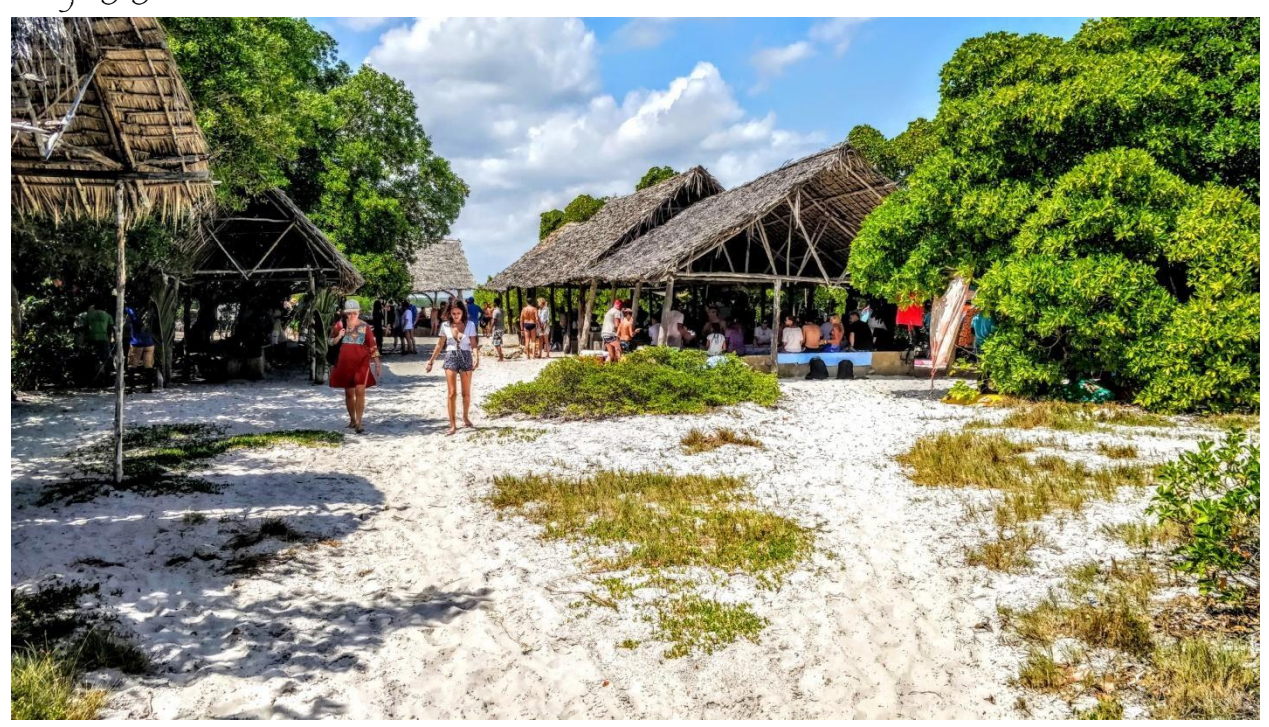
At 4:30 its time to board the boat and head back to mainland where your driver will be waiting to drive you back to your hotel or desired drop off point in time for dinner. End of our program!!