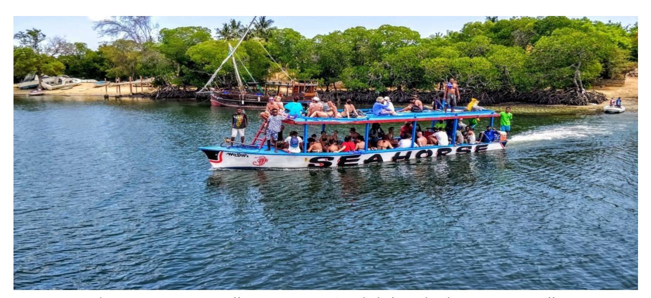
At around -1:00pm we will arrive at Sudi Island where you will receive a warm welcome to the island followed by a little entertainment from the natives.