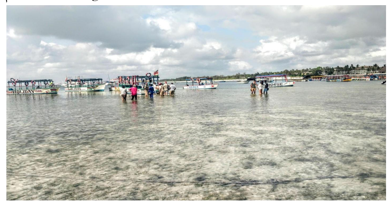
At around 9:30 am we arrive at the Marine Park Watamu. Your driver will hand you over to the captain/guide who will make sure your marine park fees is paid, and then you will board a motorized 2 décor glass