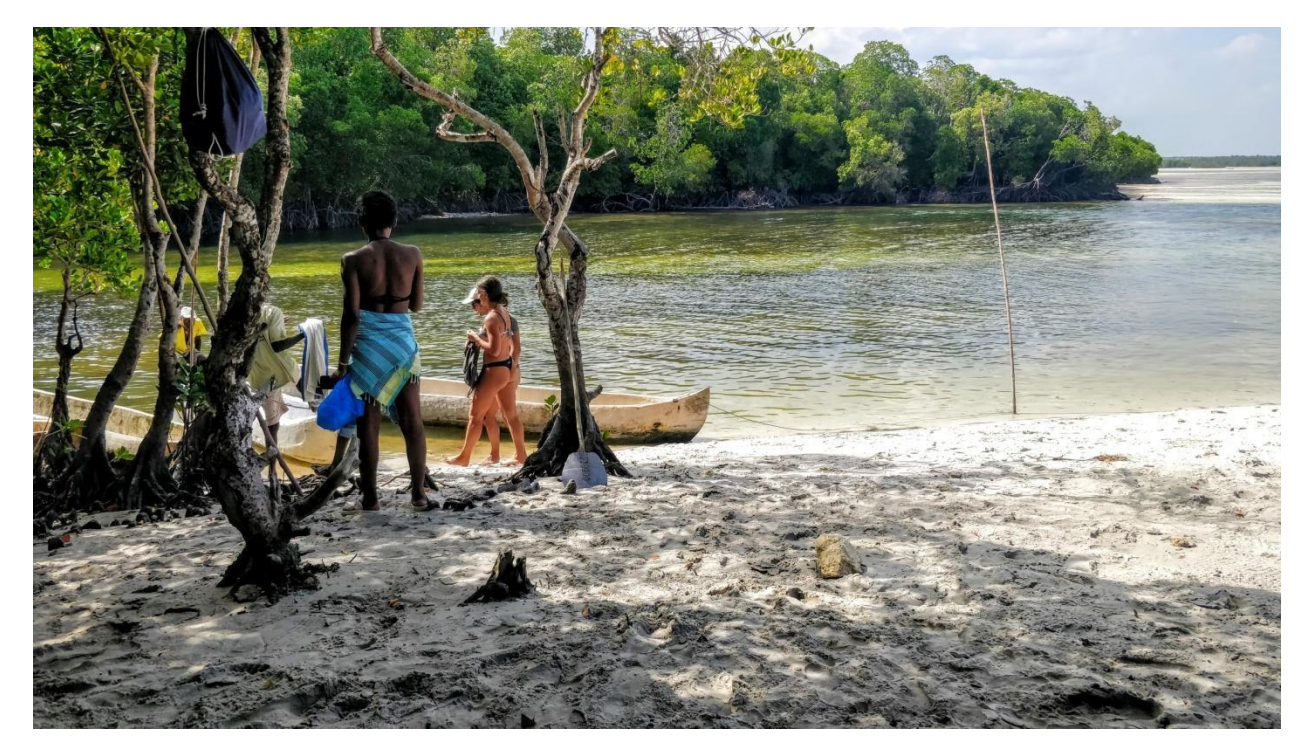
Enjoy your last moments at the island and its environment.